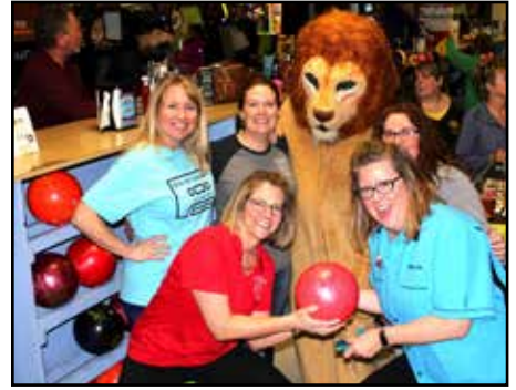
A fun afternoon was had at the Jordaness Lions Annual Bowling event on January 25th. Prizes, raffles, bowling, visiting, and lots of laughs all benefiting great projects!