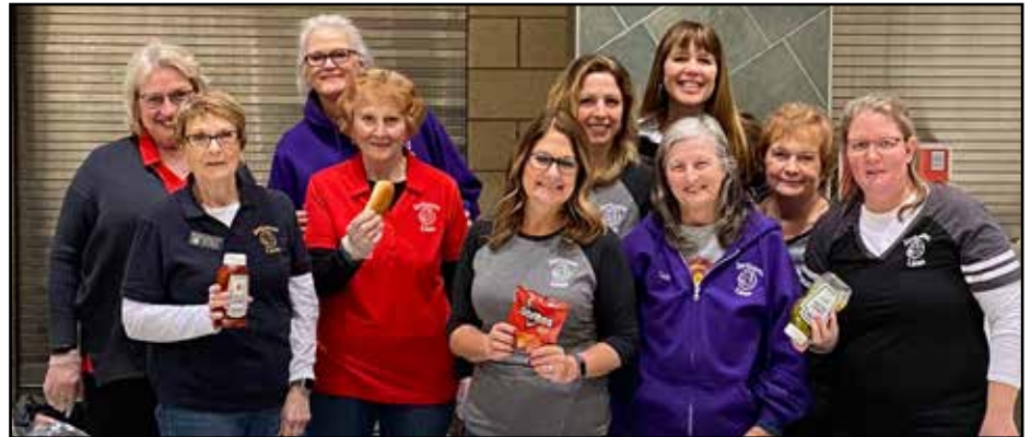
Jordaness club members served hungry basketball fans during recent girls' and boys' basketball games at Jordan High School. Proceeds from this fundraiser will be used to provide scholarships for graduating seniors.